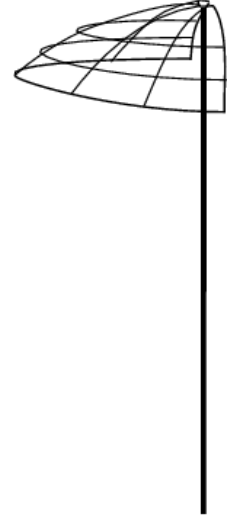
Single half top